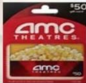
2 nd Place Gift Certificate