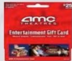
3 rd Place Gift Certificate

Email all typed essays by January 31, 2017 to oliverralph@hotmail.com by 11:59pm