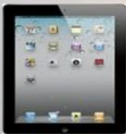
1 st Place Apple iPad

Essays typed, double-spaced, contain 500 words or less, be original, and include a cover sheet with the following information (name, grade, age, school name, school address, telephone number and church, if applicable). Judged essays based mainly on thought and content; however, spelling, correct grammar, and punctuation is considered. The contest theme for the essay: In your own words, explain the importance of the “I Have a Dream,” speech by Rev. Dr. Martin Luther King, Jr. and its relevance for today. Also, talk about your own personal dream and how it will impact the world.